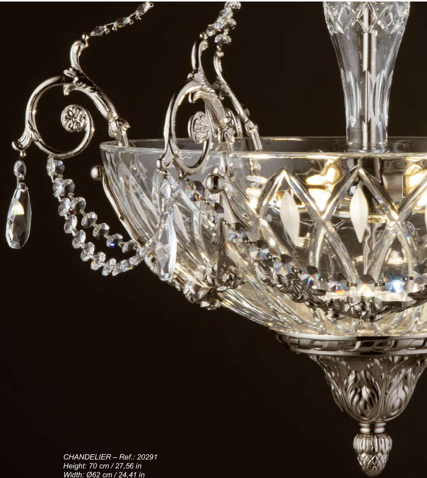
CHANDELIER – Ref.: 20291 Height: 70 cm / 27,56 in Width: Ø62 cm / 24,41 in Net weight: 35,00 Kg / 77,09 lb Finish: N.I.B (516) Materials: Casted Bronze & Italian hand cut crystal. 6 (E14)