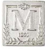
PLANT (387) Antique Silver Plated