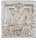
PPE (391) Old Silver Leaf