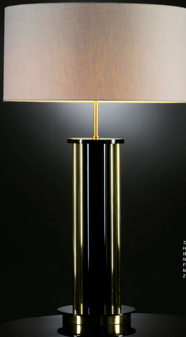
TABLE LAMP – Ref.: 20271 Height: 80 cm / 31,5 in Width: Ø 50 cm / 19,69 in Net weight: 8,00 Kg / 17,62 lb Finish: DB (67) Materials: Brass. 2 (E27)