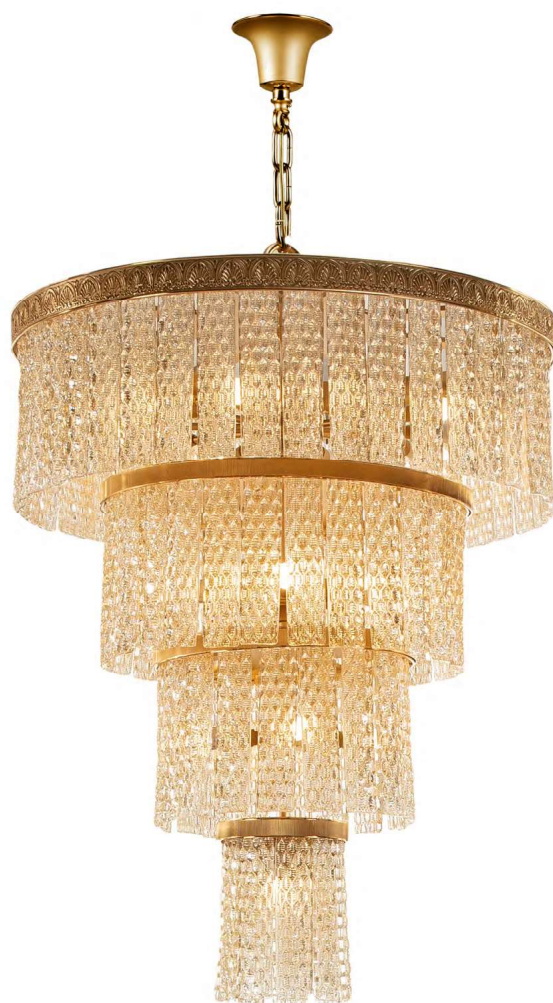
PENDANT – Ref.: 20274 Height: 90 cm / 35,43 in Width: Ø80 cm / 31,50 in Net weight: 40,00 Kg / 88,11 lb Finish: O.A. (231) Materials: Casted Bronze & Venetian Glass. 25 (E14)