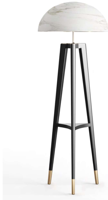
FLOOR LAMP- Ref.: 20285.0 Height: 170 cm / 66,93 in Width: Ø 50 cm / 19,69 in Net weight: 49,00 Kg / 107,93 lb Finish: DB/NO (67/19) Materials: Brass, Wood & Krion. 1 (E27)