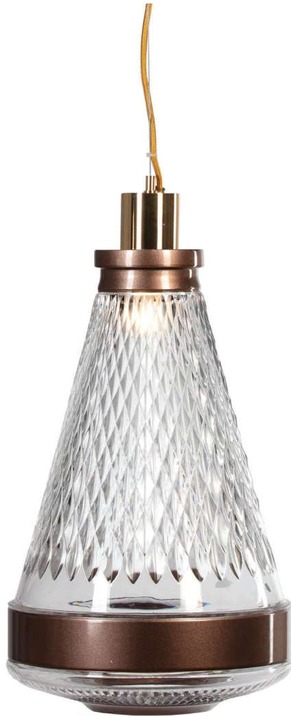
PENDANT – Ref.: 20289.1 (BRONZO GLASS) Height: 120 cm / 47,24 in Width: Ø 35 cm / 13,78 in Net weight: 20,00 Kg / 44,05 lb Finish: DB (67) Materials: Brass & Italian hand cut crystal. 1 (E27)