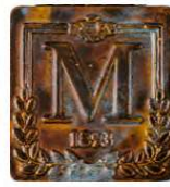
BROX (211) Oxidized Bronze