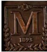
BE (316) Aged Bronze