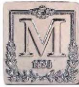
NI.B (516) Polished Nickel