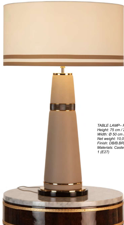
TABLE LAMP- Ref.: 20280.0 Height: 75 cm / 29.53 in Width: Ø 50 cm / 19.69 in Net weight: 10,00 Kg / 22.03 lb Finish: DB/B.BR/NB (600) Materials: Casted Bronze & Leather. 1 (E27)