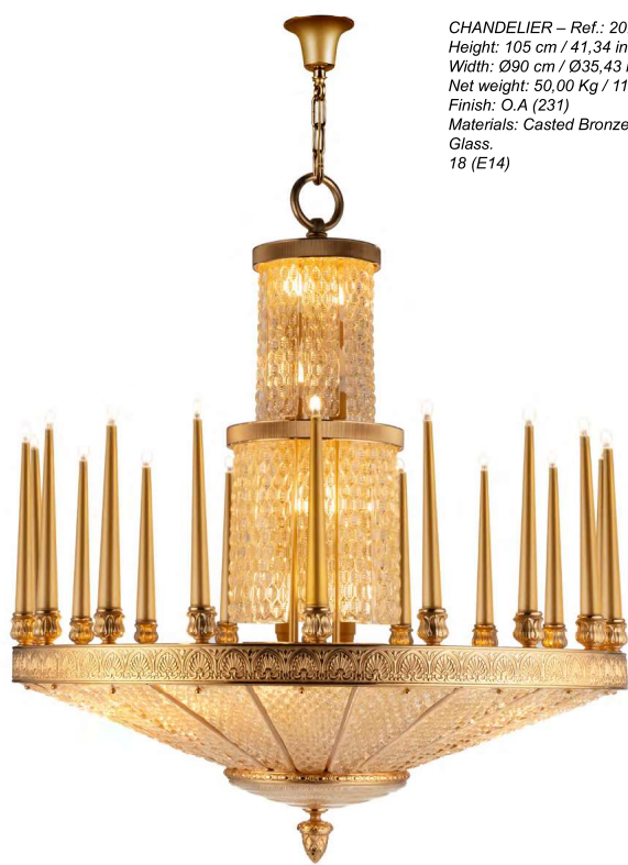
CHANDELIER – Ref.: 20273 Height: 105 cm / 41,34 in Width: Ø90 cm / Ø35,43 in Net weight: 50,00 Kg / 110,13 lb Finish: O.A (231) Materials: Casted Bronze & Venetian Glass. 18 (E14)