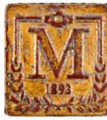
POE (380) Old Gold Leaf