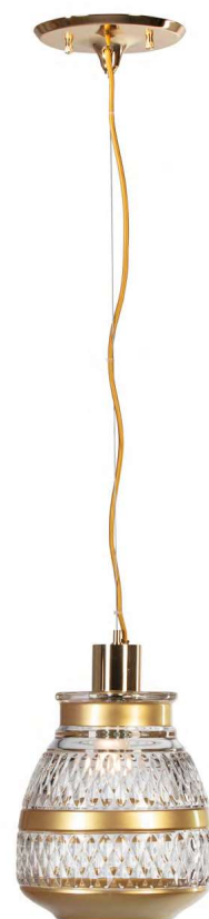
PENDANT – Ref.: 20290.0 (GOLD GLASS) Height: 120 cm / 47,24 in Width: Ø 30 cm / 11,81 in Net weight: 15,00 Kg / 33,04 lb Finish: DB (67) Materials: Brass & Italian hand cut crystal. 1 (E27)