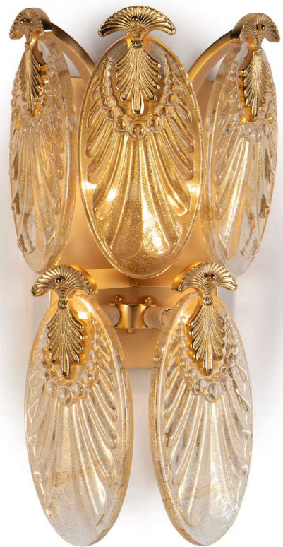
WALL BRACKET – Ref.: 20277 Height: 52 cm / 20,47 in Width: 29 cm / 11,42 in Depth: 17 cm / 6,69 in Net weight: 10,00 Kg / 22,03 lb Finish: OA (231) Materials: Casted Bronze & Venetian glass. 4 (G9)