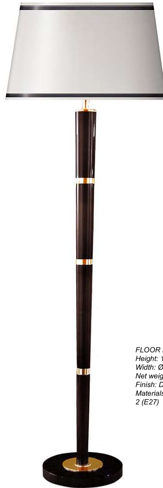
FLOOR LAMP– Ref.: 20283.0 Height: 175 cm / 68,9 in Width: Ø 60 cm / 23,62 in Net weight: 39,00 Kg / 85,90 lb Finish: DB/ N.A.B (67/515) Materials: Brass & Wood. 2 (E27)