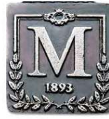
PLA.VI (56) Old Silver