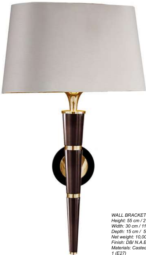
WALL BRACKET – Ref.: 20282 Height: 55 cm / 21,65 in Width: 30 cm / 11,81 in Depth: 15 cm / 5,91 in Net weight: 10,00 Kg / 22,03 lb Finish: DB/ N.A.B (67/515) Materials: Casted Bronze & Venetian glass. 1 (E27)