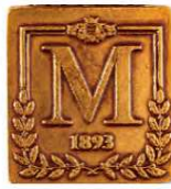
OF (55) French Gold