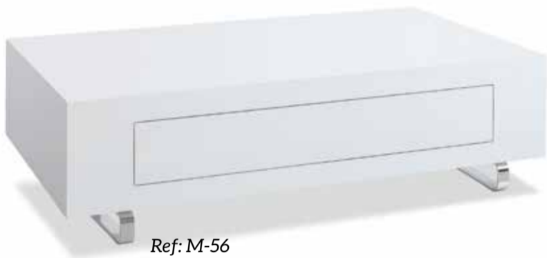
Ref: M-56 Ref: 54361 (Acero/Steel/Acier)