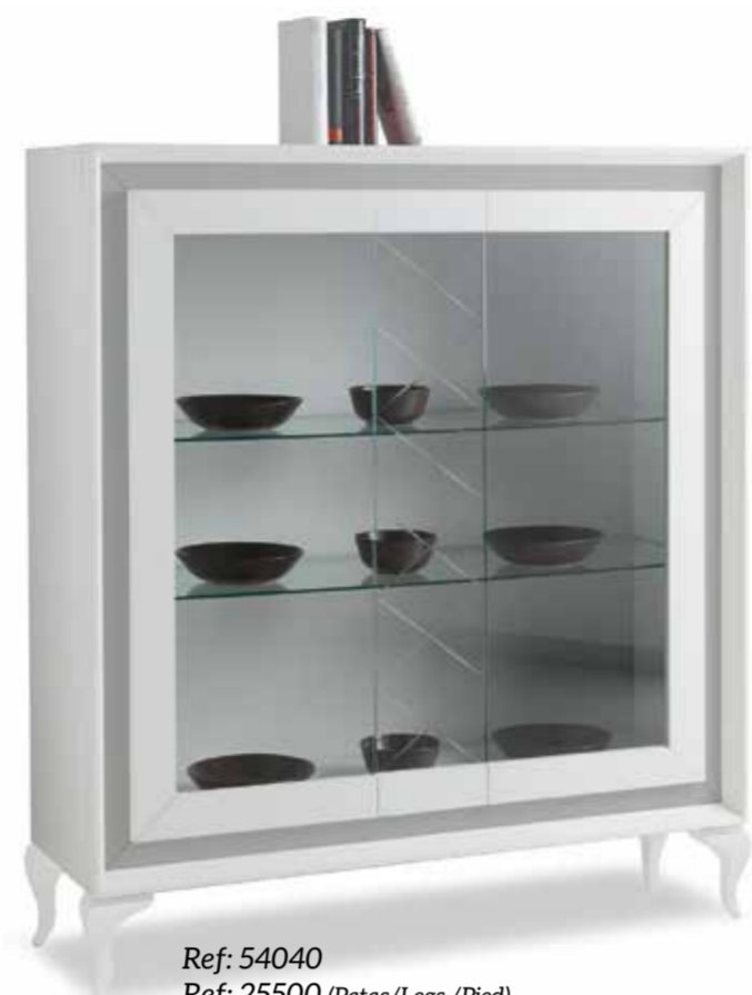
Ref: 54040 Ref: 25500 (Patas/Legs /Pied)