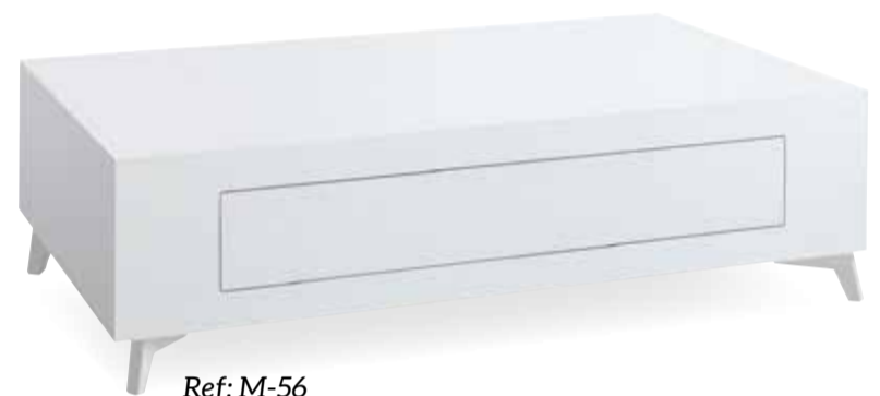
Ref: M-56 Ref: 54333 (Doble aguja / Twin needle leg / Pied d'aiguille double )