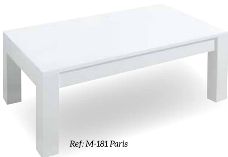
Ref: M-181 Paris