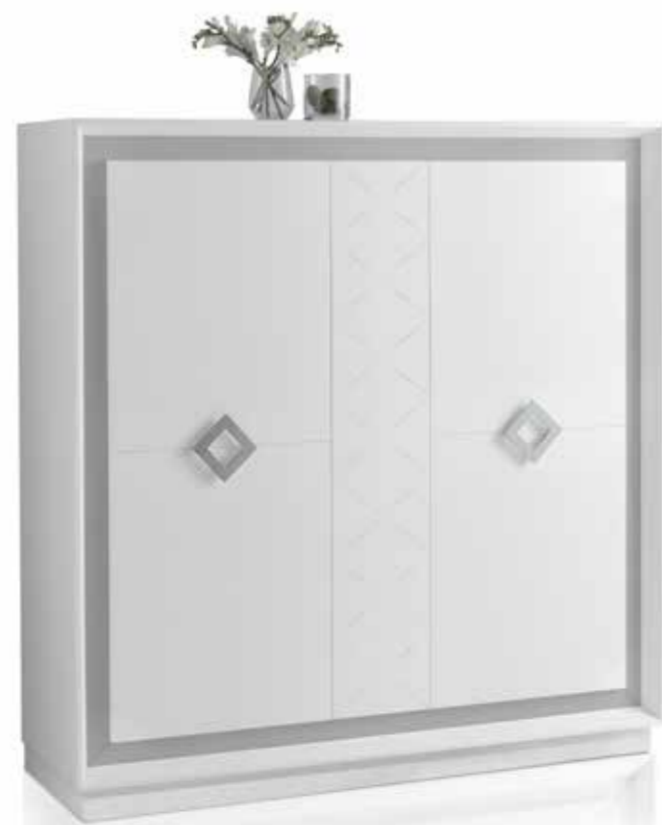
Ref: 54042 Ref: 54306 (Zocalo/Plinth /Socle) Ref: T-54 (Tirador/Handle/Poignée)