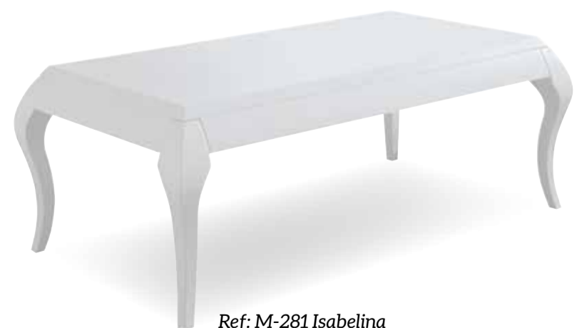
Ref: M-281 Isabelina