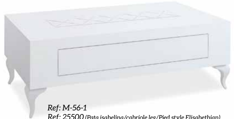
Ref: M-56-1 Ref: 25500 (Pata isabelina/cabriole leg/Pied style Elisabethian)