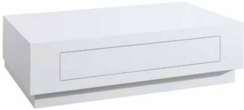
Ref: M-56 Ref: 54356 (Zocalo/Plinth /Socle)