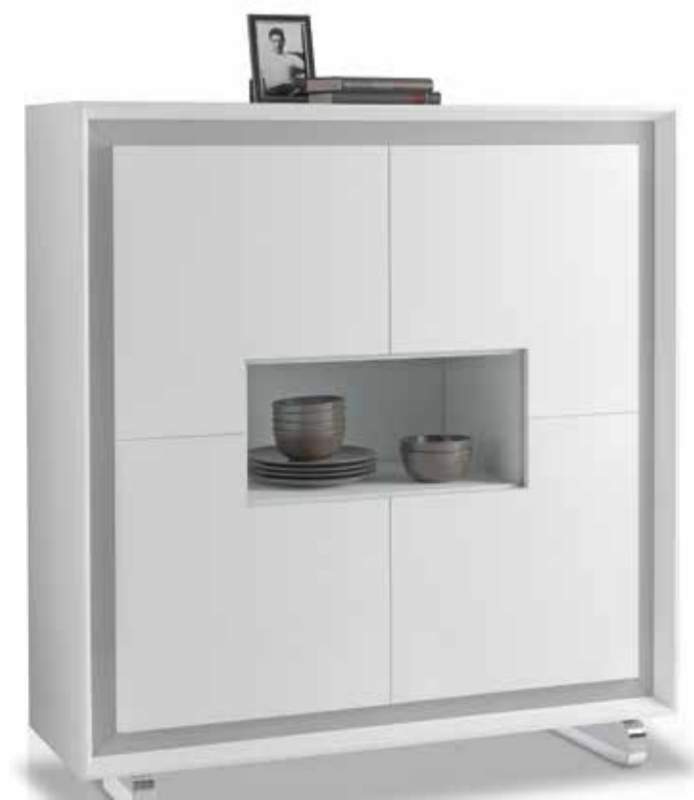
Ref: 54044 Ref: 54360 (Patas/Legs /Pied)