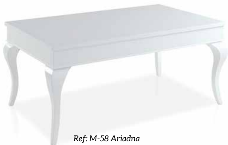
Ref: M-58 Ariadna