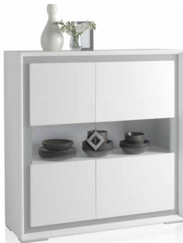
Ref: 54043 Ref: 25502 (Patas/Legs /Pied) Ref: T-54 (Tirador/Handle/Poignée)