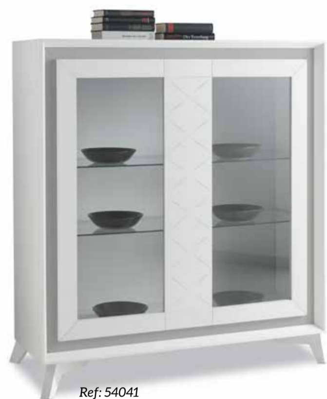
Ref: 54041 Ref: 54332 (Patas/Legs /Pied)