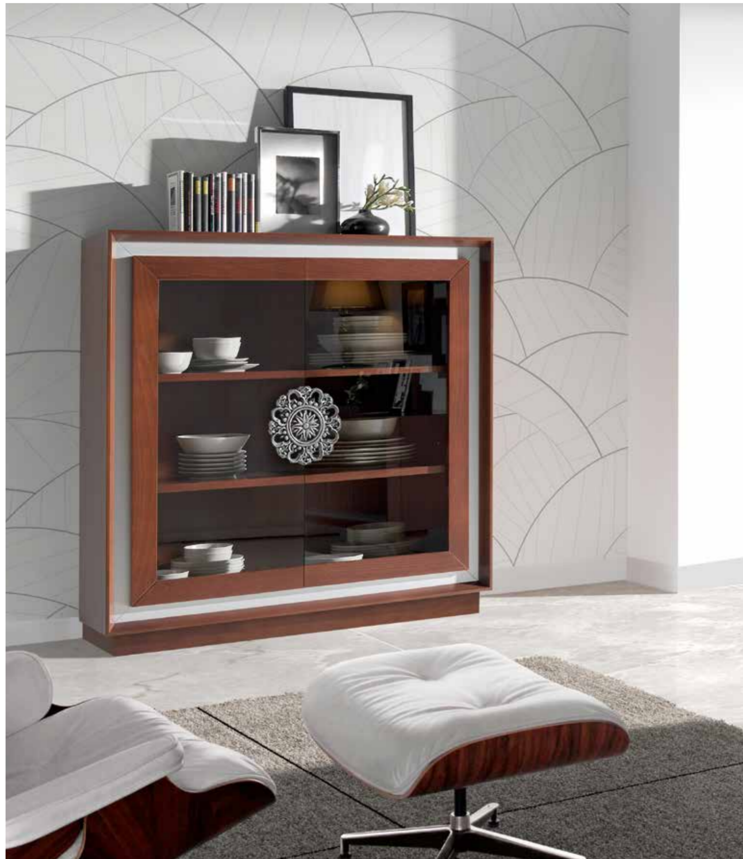
Ref: 54040-1 Ref: 54306 (Zocalo/Plinth /Socle) Ref: T-301 (Tirador/Handle/Poignée)